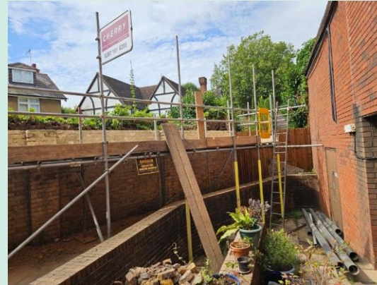
> As part of the works the main wall had to be reduced in height, and made safe.

Accessibility was a top priority for the garden's layout. A new ramp was installed to ensure that people with disabilities or mobility challenges can easily enjoy the space.