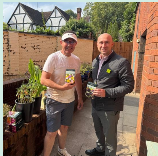
> Waitrose have donated plants and bulbs, along with old crates which have been upcycled to create planters.