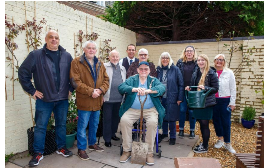
> Volunteers from the local community and members of the centre management team took part in creating the garden.