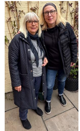
> Local gardening enthusiasts volunteered their time and expertise.