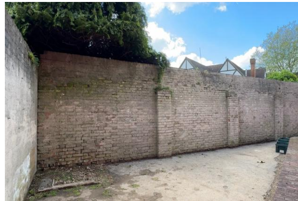
> The neglected space has been transformed into a peaceful and inspiring environment

the centre management team, played a key role in preparing the site and painting the walls, creating a sense of shared ownership and pride.